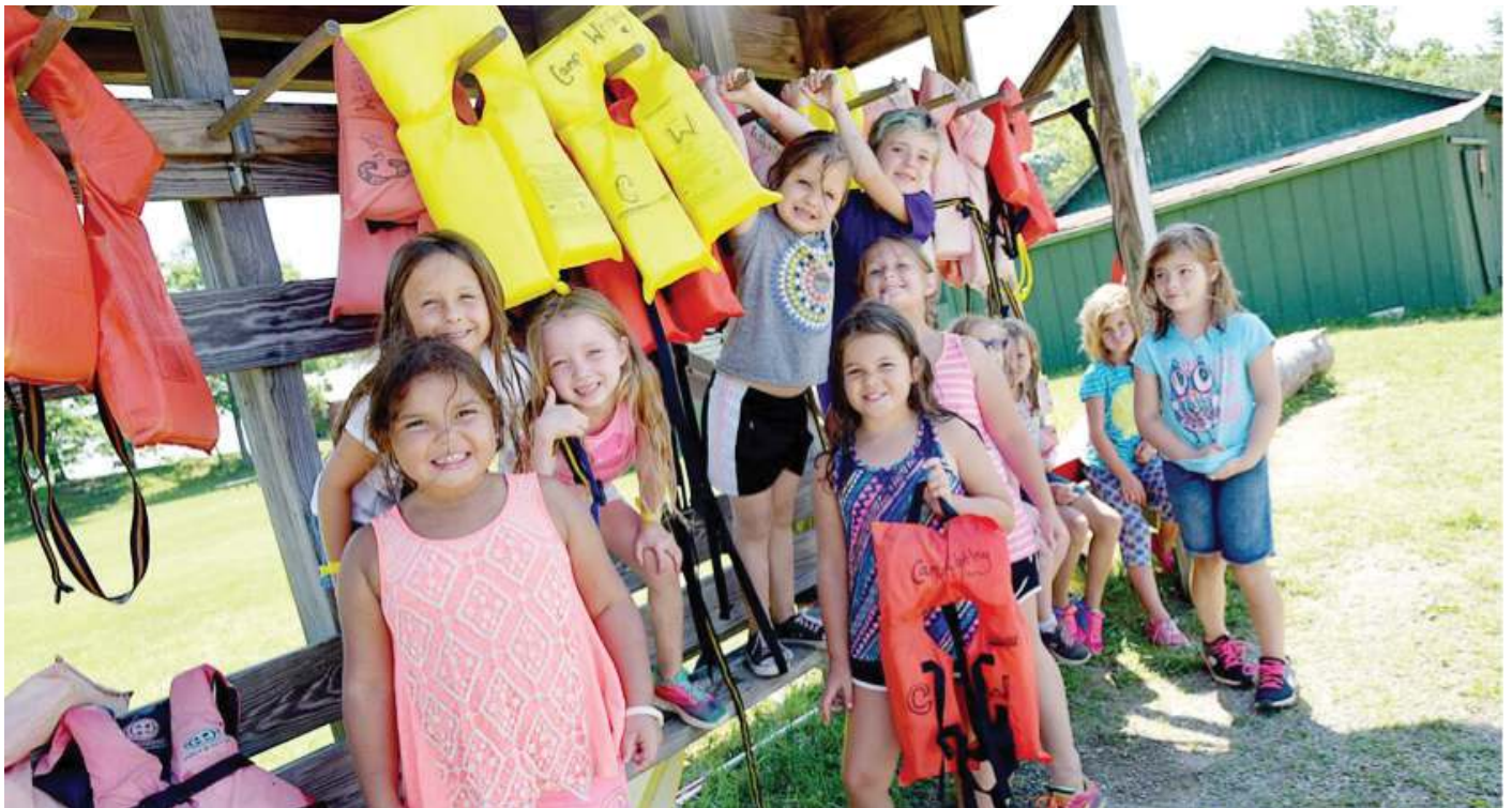
Camp Whitley's Endowment Fund continues to grow thanks to the generosity of former campers who warmly remember summers spent exploring Tinkham's Woods and splashing around in TROY Cedar Lake. Their gifts make sure that camp will be around for generations to come.