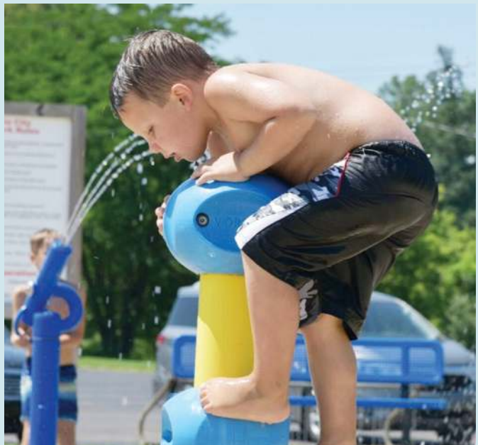
An endowment fund exists to offset the costs of running and maintaining the Splashpad in Morsches Park.