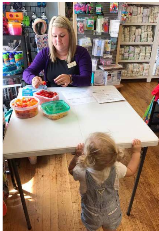
A tiny visitor waits patiently for a snack at Whitley County B.A.B.E.