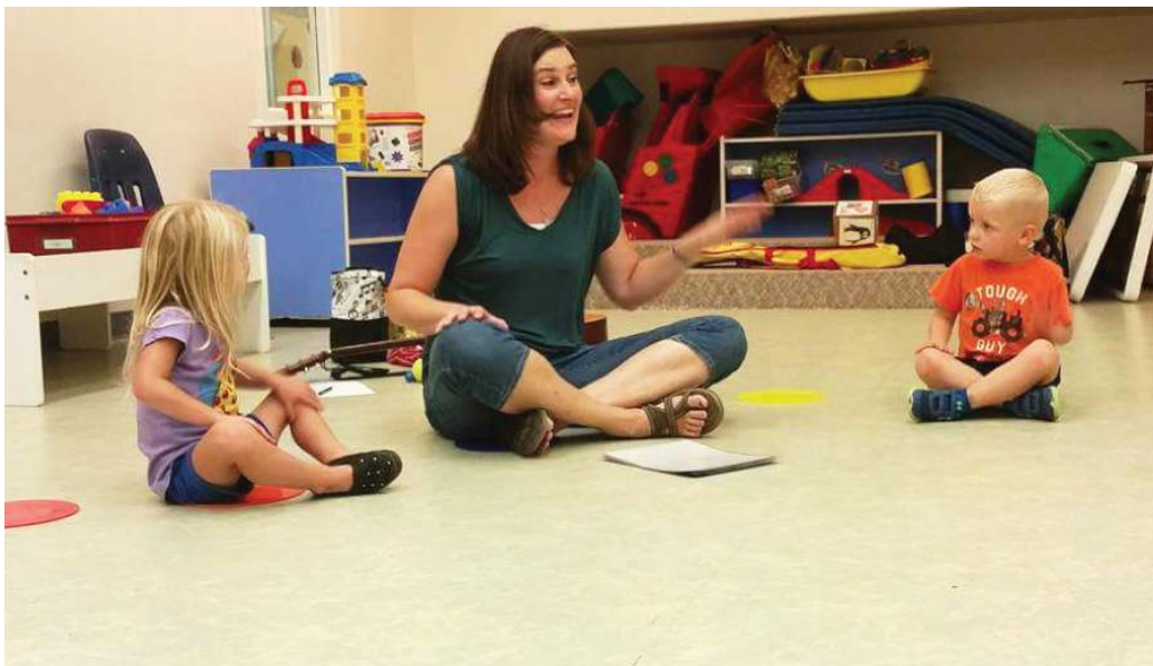
Name that Tune! Exposing children to music during early development helps them to learn the sounds and meaning of words while also allowing them to practice self-expression. In 2017, a Community Foundation grant to Churubusco Child Care Center allowed students to reap the benefits of having a music therapist visit their classrooms.