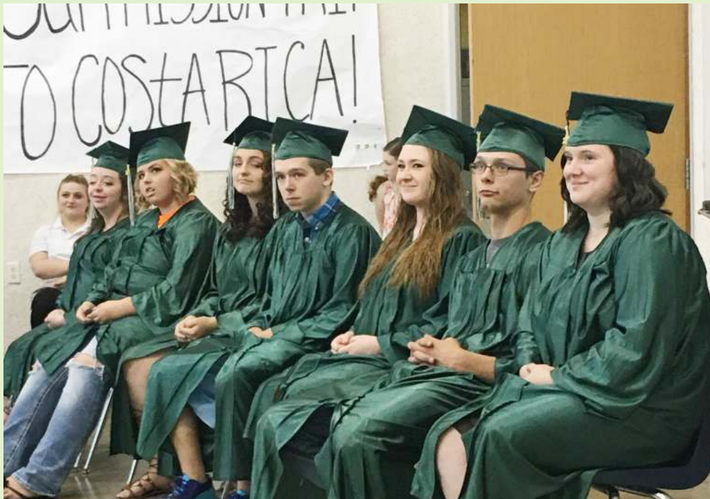
TROY Center graduates waiting anxiously for their diplomas at their graduation ceremony.

Plans for the Marshall building led the YIC to relocate in the basement of what is now The Center for Whitley County Youth. Paint and elbow grease made the windowless area satisfactory for a time until flooding took their computers and left classrooms damp. Members of the First Church of God Church kindly opened their doors and invited the organization to utilize an upstairs area of their building where students were guests for three years. In time, they outgrew borrowed quarters and moved again to the former ETNA TROY School in Northern Whitley County. It was here their name changed to TROY School (Teaching and Reaching our Youth) and leadership opted to pursue the designation of a freeway school, an official 501 (c)3 organization, independent of the local court system.