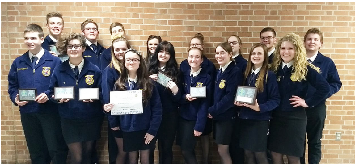
Columbia City High School FFA Students pose together at the District III FFA Convention. They brought home several awards that evening, and even had an event team head to the state finals!

Irma & Donald Ferber Scholarship Fund Roark Fizer Scholarship Fund Max Gandy Scholarship Fund Betsy Jayne Gates Memorial Scholarship Fund James E. & Janice M. Hammer Academic Team Scholarship Fund Timothy Hearld Memorial Scholarship Andrea Norman Henry and John Anthony Norman Theater Scholarship Fund Ernest Earl Heimbach Scholarship Fund Lindsey Hively Scholarship Fund Randall & Patricia Holler Business Scholarship for Manchester University Robert Hood Scholarship Fund Todd Jagger Memorial Scholarship Fund Jakes Scholarship Fund Robert & Grace Karst R.N. Scholarship Fund Ben Konger Memorial Scholarship Fund Korean War Awareness Scholarship Fund Margo Langohr Scholarship Fund