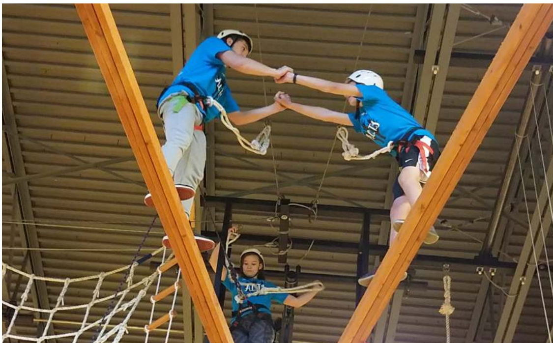
Team building exercises were the name of the game when students met for the first time to participate as members of ACTS, the Foundation's most recent youth philanthropy venture, offered in partnership with The Center, TROY School and home schooled students.