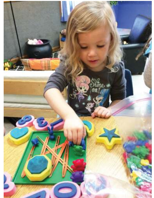
The Dekko Childcare Enhancement Fund is a Field of Interest endowment that exists to support projects and programs that help the youngest community members to bloom developmentally.

Girl Scouts of NE Indiana-Michiana $ 2,455