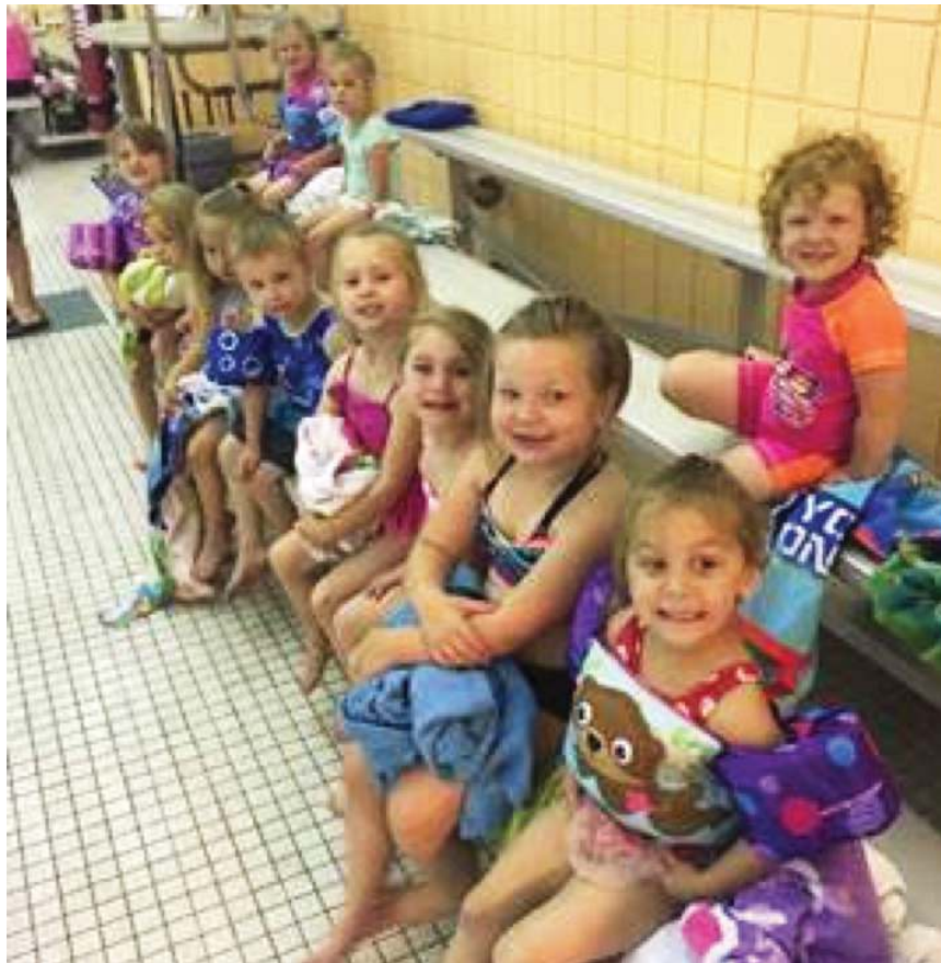
Agency endowment funds help to support important programs including such as this little learner's swim class offered to students who are part of the YMCA's Armstrong Early Learning Center.