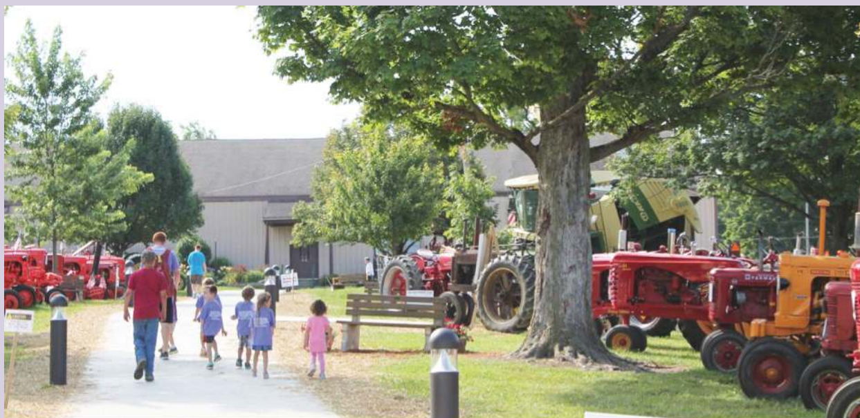
Whitley County's rich farming heritage is celebrated each year at the annual 4-H Fair. The Community Foundation holds the 4-H Beef Scholarship and the 4-H Helping Hands Scholarship which are awarded to deserving students each summer.