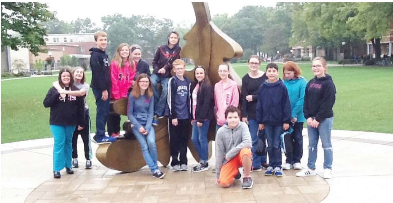
These Churubusco 7th grade students learned first-hand what life is like on a college campus when they toured Manchester University. The Foundation has sponsored 7th grade college visits for Whitley County students for the past 15 years.