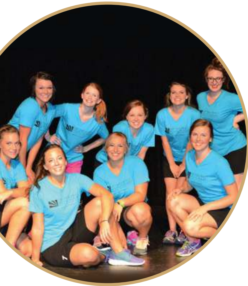
The Foundation proudly holds funds for Whitley County's Distinguished Young Women's Scholarship Program which inspires high school girls to develop their individual potential through a fun, transformative pageant experience.

Established to assist small organizations with financial book-keeping for their charitable projects, the Community Foundation holds a number of non-permanent funds under our umbrella. Unlike gifts to endowments that can never be spent, gifts to non-permanent funds can be spent in their entirety. Gifts to these funds are tax-deductible as long as no goods or services were received in exchange for the contribution.