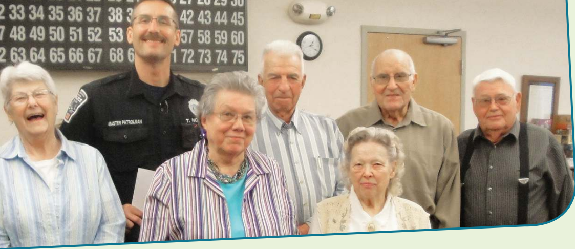
The Whitley County Council on Aging helps local seniors lead productive, independent lives. The Foundation helped to support their mission with a grant to help purchase a new van in 2014.*