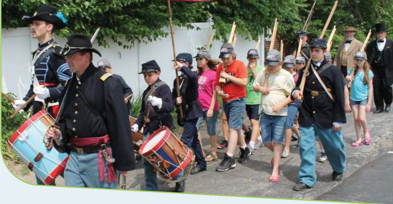
History comes alive for Whitley County youth during the Historial Museum's Civil War Camp.*