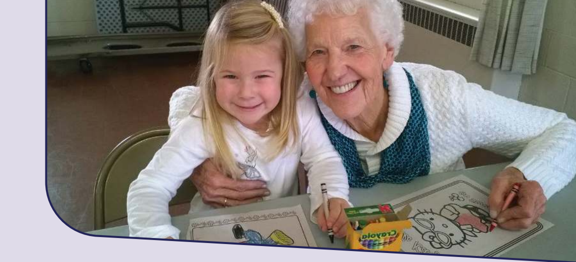
Seniors and preschoolers became pals during One Community's free lunch program in South Whitley.