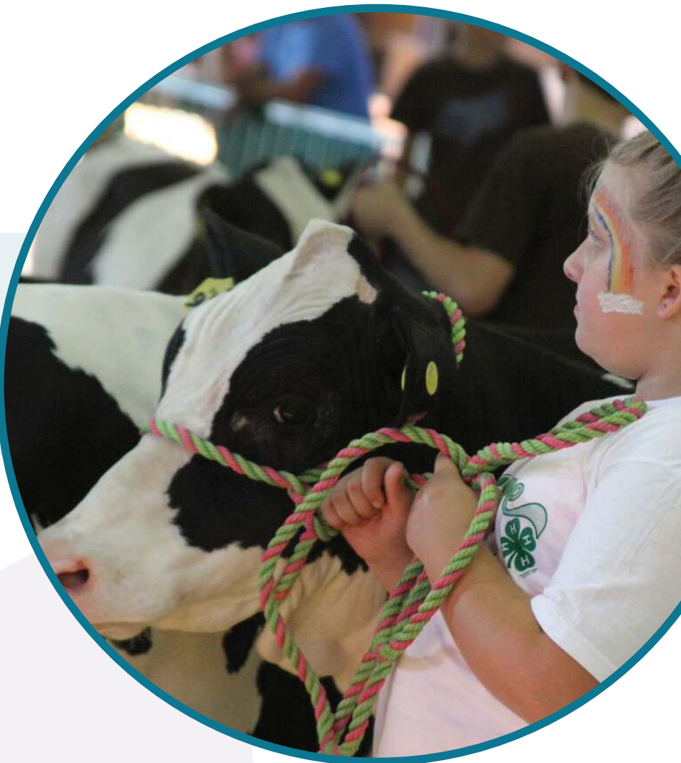
There's more to showing cows than simply walking into a ring. The 4-H Beef Club Scholarship is awarded to a deserving, college bound student each fall.*

Kenny Simon Scholarship Fund Andy Spencer Memorial Scholarship Fund Nicholas and Laurel Steill Scholarship Fund Ashley Morgan Storm Memorial Scholarship Fund Turtletown Players Scholarship Fund Ross Unverzagt Memorial Scholarship Fund Jerry Walker Memorial Scholarship Fund Wagh Scholarship Fund Howard and Mimi Wherry Memorial Scholarship Fund Harold "Potch" Wheeler Memorial Scholarship Fund Charles White Scholarship Fund Whitley County Builders Association Fund Whitley County Retired Teachers' Association Scholarship Fund Whitko Scholarship Fund B.V. and Flossie Widney Memorial Scholarship Fund Megan Young Memorial Scholarship Fund Rely C. and Izora Zumbrun Education Fund