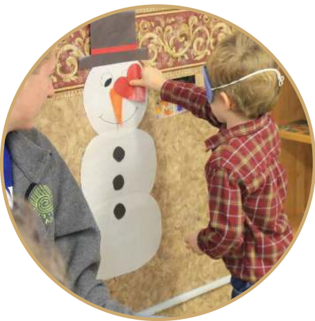
H.A.N.D.S. is the Foundation's youth philanthropy initiative which helps transform local teens into knowledgeable grant makers. Each year the group organizes an annual holiday party for children in the local Head Start program.